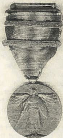
VICTORY MEDAL (WW I)

hundred yards north of Ypres in Flanders beside the little cemetery (called Essex Farm). McCrae could see the wild poppies that sprang up from the ditches and the graves." - from The Heritage of the Great War , webmaster Rob Ruggenberg, http://www.geocities.com/~worldwar1/default.html