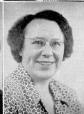
Mildred Brindle Office